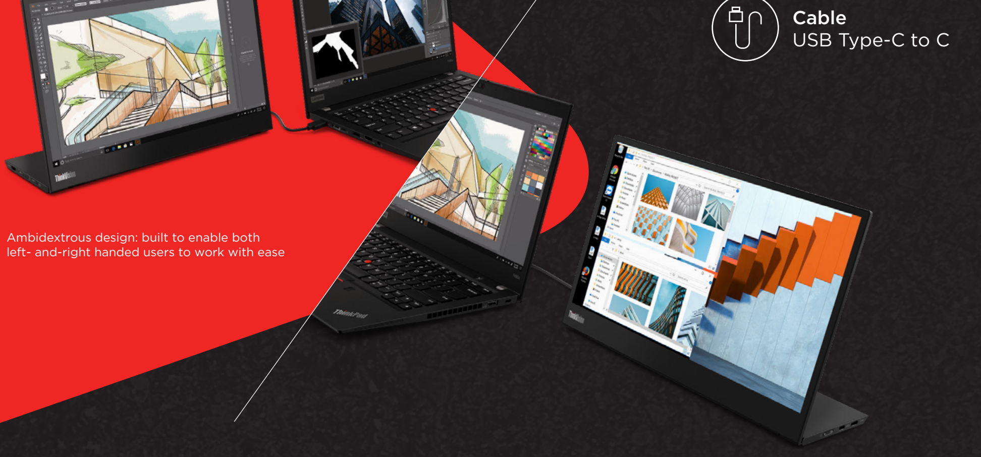
Ambidextrous design: built to enable both left- and right-handed users to work with ease

Two innovative USB Type-C ports on either side of the monitor make connectivity effortless. These ports support both power and video delivery simultaneously from a single port. The ThinkVision M14 also offers a 'power pass through' design that powers the mobile monitor by an adapter and charges the notebook at the same time. This feature is suitable for smartphones or notebooks with one USB Type-C port**. The ambidextrous design of this monitor enhances user comfort.